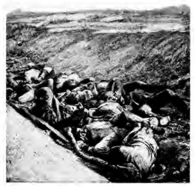
The mand of particle road in front of link of 1720 p. v.; name roughlite last